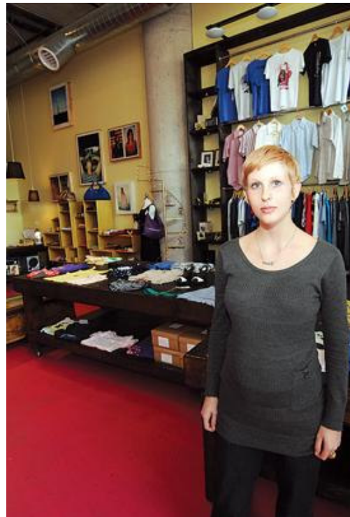
Apartment 3.

This funky Arts District boutique keeps regular business hours