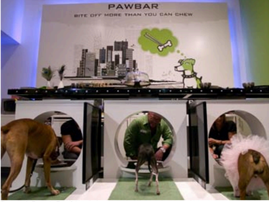
Pussy & Pooch Pawbar

by CJ Arabia (Subscribe to CJ Arabia's posts) Mar 11th 2011 @ 1:00PM Filed Under: Dogs , Traveling with Pets